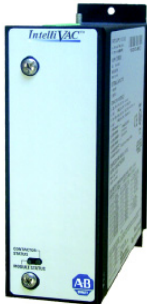
Figure 1 - IntelliVAC Contactor Control Module

An IntelliVAC™ control module can be used to control Bulletin 1502 450 and 800 A medium voltage vacuum contactors. Both electrically held and mechanically latched contactor types can be controlled with IntelliVAC control modules.